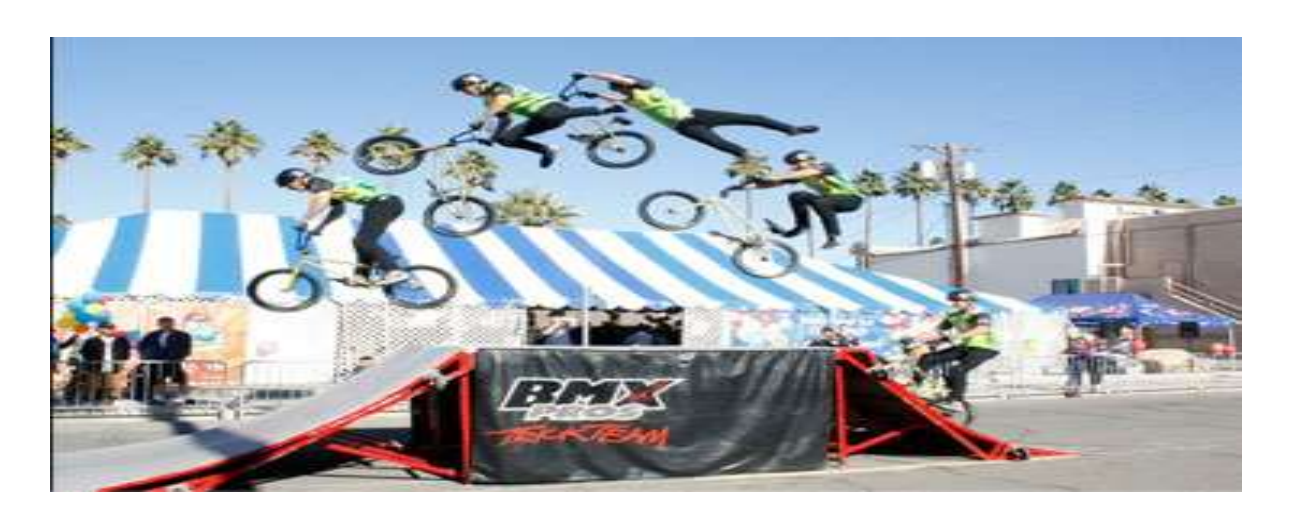
The PTO can bring this assembly to our kids because of funds raised at Spring Fling 2018.

These BMX showstoppers will defy gravity, spin themselves silly and perform out of this world stunts!!